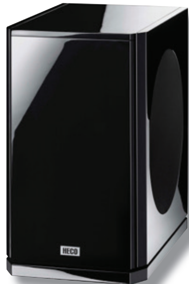
Aleva GT Sub 322A