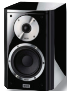
Aleva GT 202