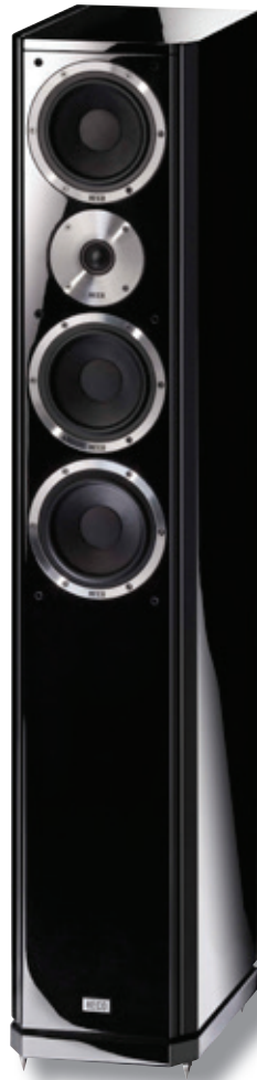
Aleva GT 602