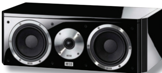
Aleva GT Center 32