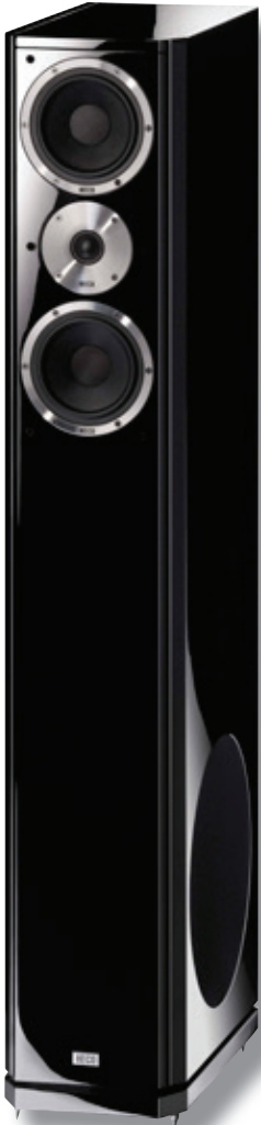
Aleva GT 1002