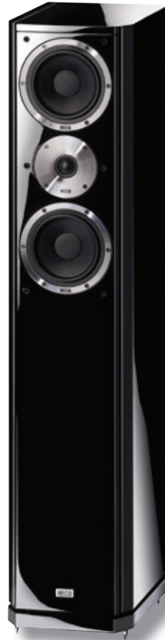
Aleva GT 402